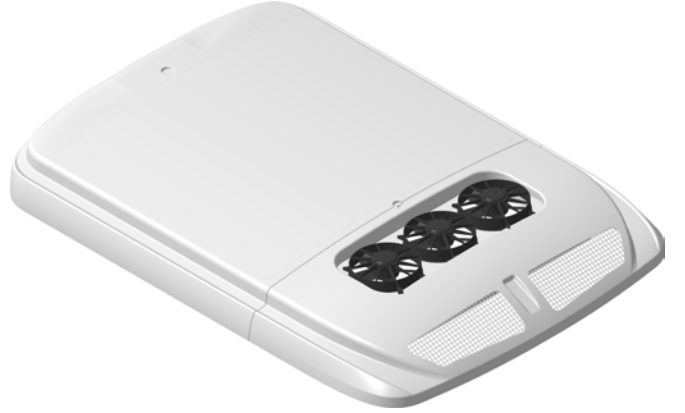
AC 111 L